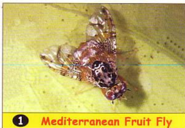
1 Mediterranean Fruit Fly