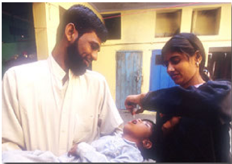
A father in Moradabad, Uttar Pradesh, India, presents his child for immunization against polio.

We'll soon be hearing more about our part in bringing this astonishing project to its successful conclusion. It's a great challenge!