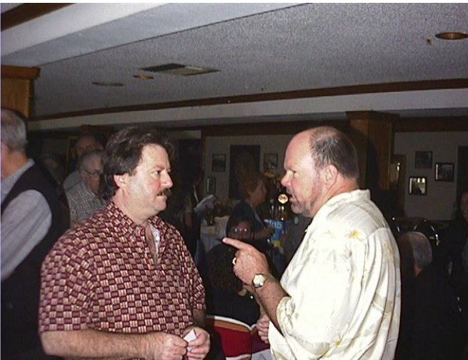
Flip tells a guest: "If you think this lunch is good, just wait until you become a club member."