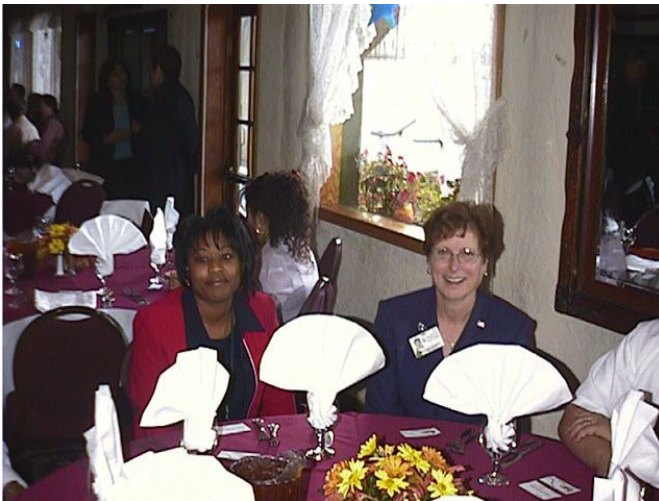
We are as pleased to have guests as they are to be here.