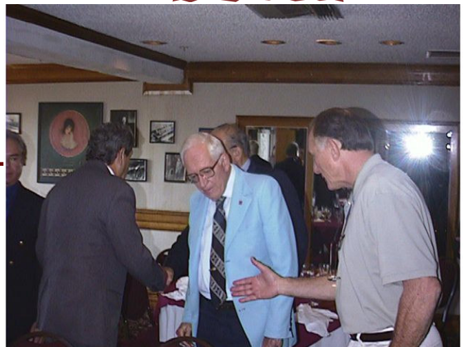
Our guests all made a point of introducing themselves to each other.