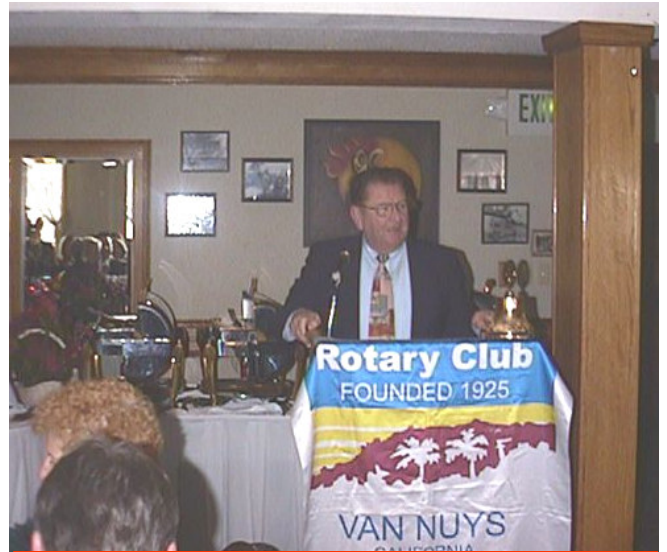
The incredibly funny Reverend Stamper was also very serious as he talked about the privilege of serving others.