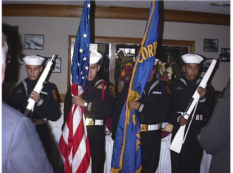
The Sea Cadets Naval Honor Guard presents the colors.