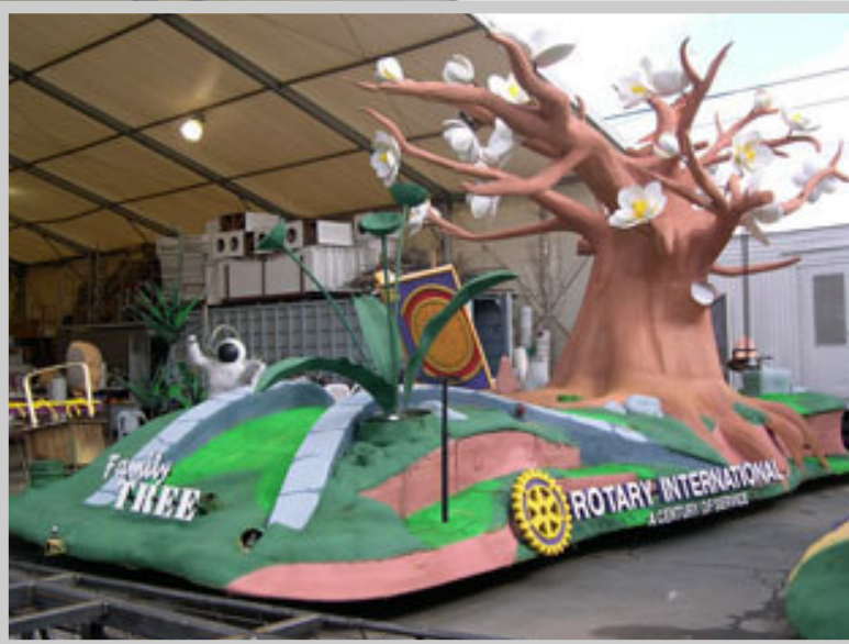
Photo of 2005 RI Float under construction.

from voluntary contributions from Rotarians in the U.S. and Canada. Design and construction of Rotary's floats is contracted to Charisma Floats and begins in early spring.