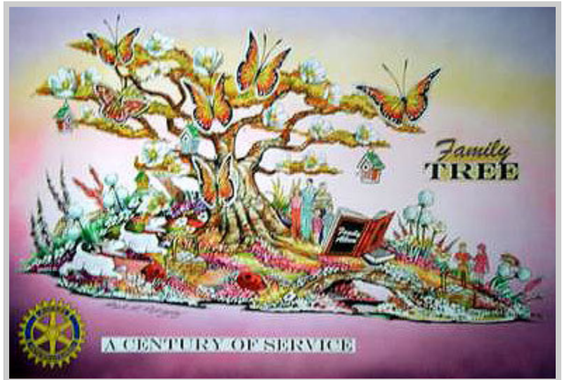
Artist's rendering of the Rose Parade Float of Rotary International for January 1, 2005.

All of the funding for each year's float is