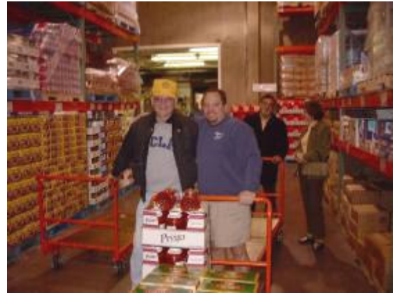
Van Nuys Rotarians purchasing food at Costco and boxing it for holiday outreach distribution to 40 disadvantaged families at Cohasset Street and Bassett Street Elementary Schools.