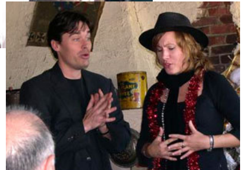
"But baby it's cold outside..."