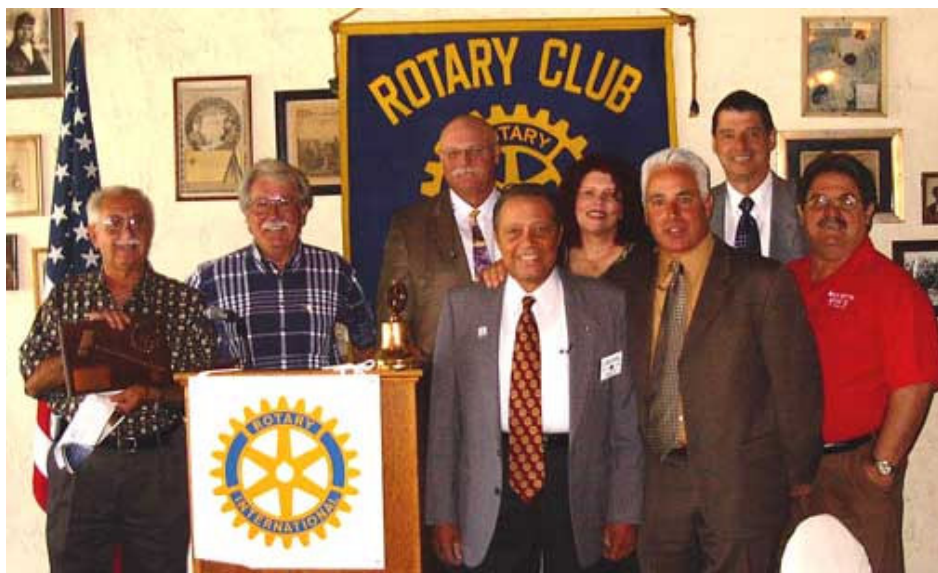
Rotary Club of Van Nuys 2004-05 Board of Directors